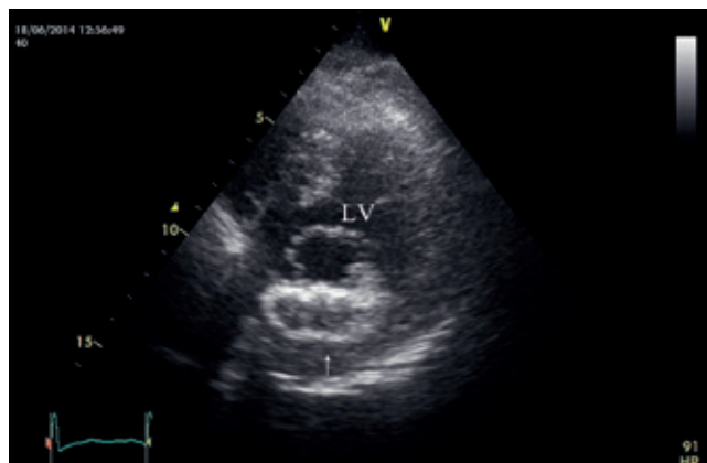
Figure 1. B

Figure 1. Echo-free space (arrow) in the posterior mitral annulus in the apical two-chamber view (A) and parasternal short-axis view (B). LA, Left atrium; LV, Left ventricle